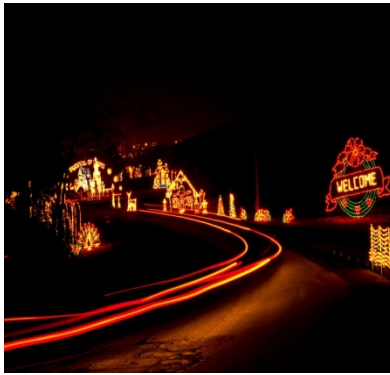
Festival of Lights