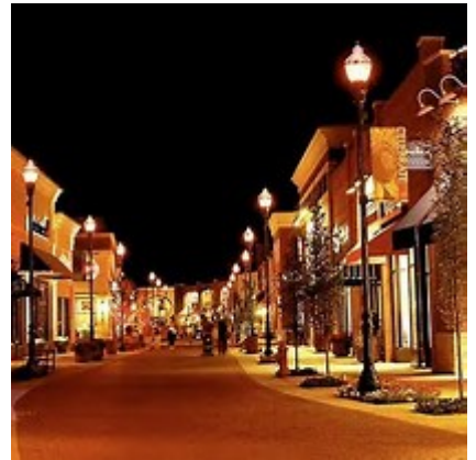
Shopping at the Branson Landing